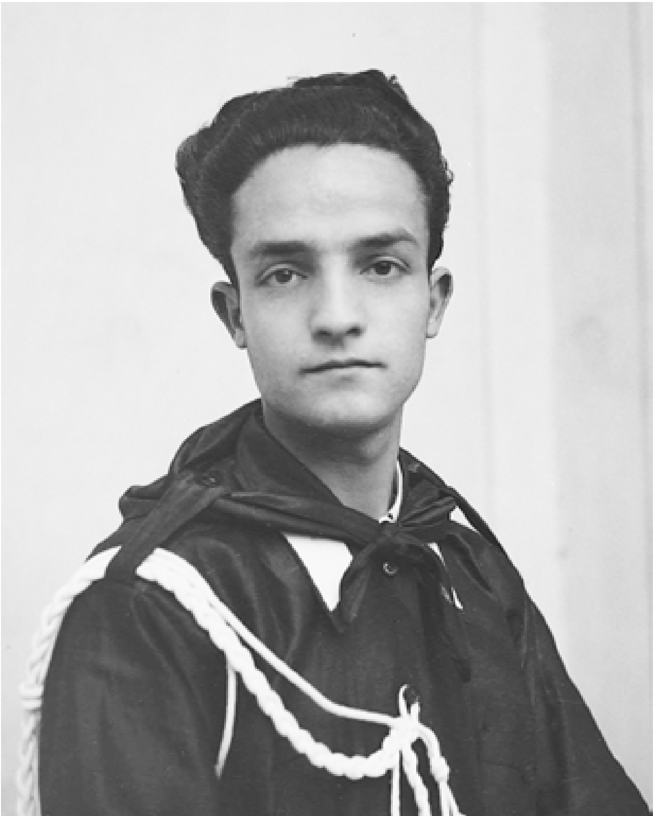
F. 3 C