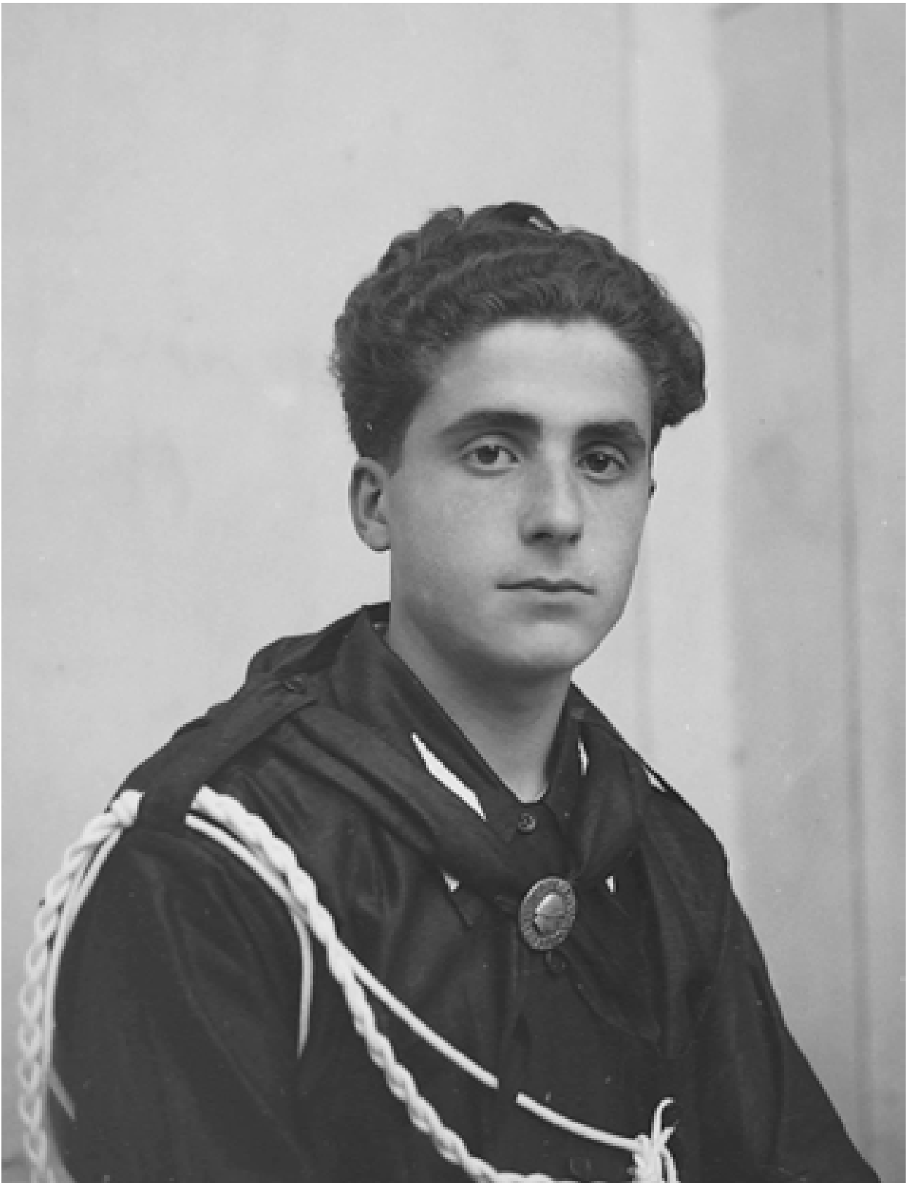
F. 2 C